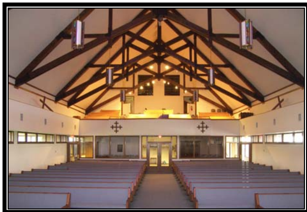
Gallery prepared for new organ

Reuter Opus 2069 was originally built in 1985 for Highland Heights Christian Church in Wichita Falls, Texas. It was made available for sale when the church merged with two other congregations. Renovation of the instrument included seven ranks of new pipes and extensions for five existing ranks, greatly enhancing the tonal resources of this versatile, two-manual organ. The Great principal chorus is exposed and the rest of the Great pipework is in its own enclosure. New framing was designed for the existing expression louvers to improve their range of motion for maximum dynamic control.