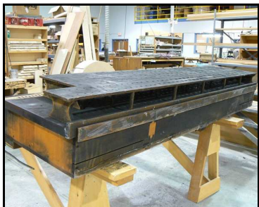
Chest after removal

Most of the original pipes were reused – a number of metal pipes received heat damage repairs in our pipe shop – and the windchests were carefully restored. After the existing components received two surface cleanings, ozone treatments removed any traces of smoke. The organ was entirely releathered, a new console was constructed using the existing console shell, and new chests and pipework were added to increase the instrument's versatility for its beautifully restored home.