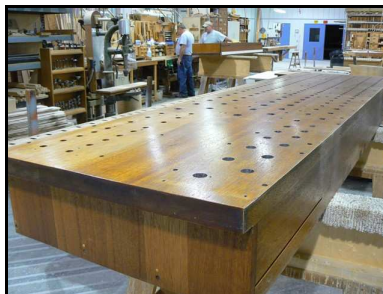
Chest after restoration